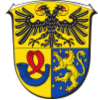
Coat of arms